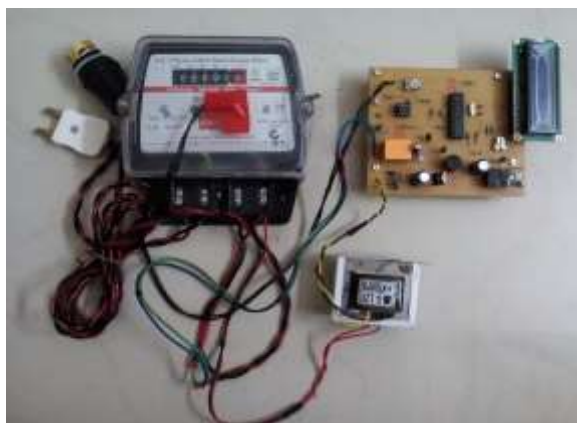
Fig. 5: Energy meter monitoring setup.