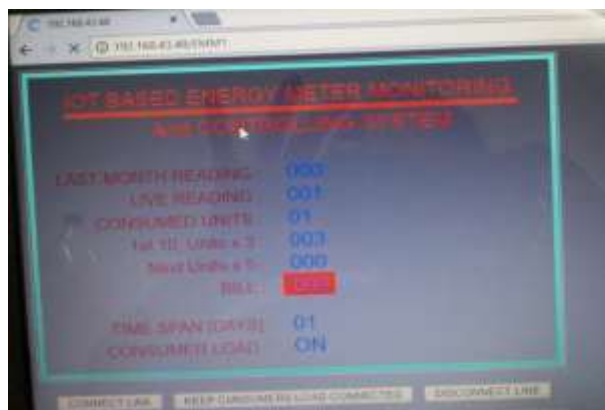
Fig. 6: Results for energy monitoring

The IOT based smart energy meter monitoring is shown in the fig6. Considering as 5seconds equals to 1day and 1pulses equals 0.1unit power consumption. By taking 5Rs per unit power the bill for two months will be calculated. The same amount will be paid for two months if the user paid the bill the supply will be given continuously after two months. After two months if he doesn't pay bill buzzer will be ON for alert purpose. Until and unless paying bill the supply line will be disconnected. Using Wi-Fi technology is more advantageous for both user side and provider side. There is no need to go at consumer side to disconnect the supply line, using IoT it can be monitored by online only.