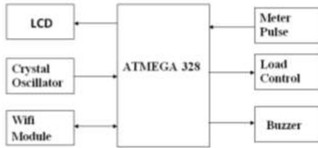
Fig. 1: Block diagram for energy monitoring

Interfacing the Wi-Fi module, liquid crystal display, buzzer, and meter pulse by using C language on Arduino ID1.6.9. LCD is 2line 16 characters, here providing 5v to activate and then it displays the IP address which needs to connect the Wi-Fi module to send the data to processor. The crystal oscillator is used to convert the digital current signals to alternate current signal which requires maintaining the entire module of energy monitoring system. Load takes 5v power from the power transformer. Energy meter will read the pulse to calculate the amount of consumed power. Here meter pulse will be counted for calculating how much power is consumed by the consumer. One example to calculate the amount for consumed power is: