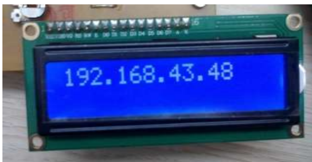
Fig. 3: Obtaining IP Address