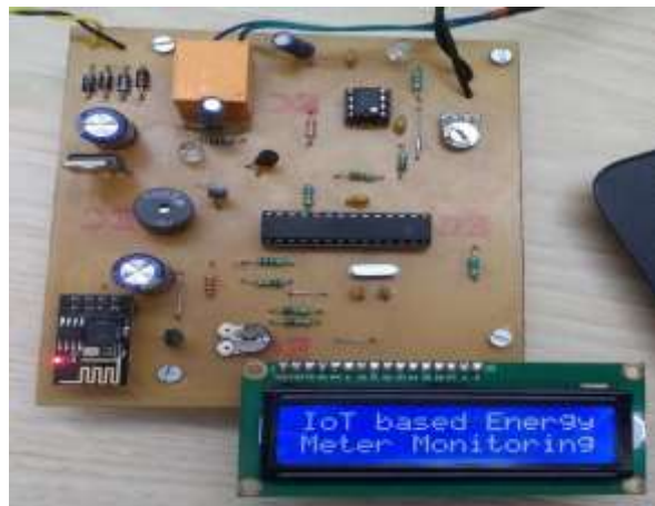
Fig. 2: Hardware prototype with module

Interfacing the Wi-Fi module, liquid crystal display, buzzer, and meter pulse by using C language on Arduino ID1.6.9. LCD is 2line 16 characters, here providing 5v to activate and then it displays the IP address which needs to connect the Wi-Fi module to send the data to processor. The crystal oscillator is used to convert the digital current signals to alternate current signal which requires maintaining the entire module of energy monitoring system. Load takes 5v power from the power transformer. Energy meter will read the pulse to calculate the amount of consumed power. Here meter pulse will be counted for calculating how much power is consumed by the consumer. One example to calculate the amount for consumed power is: