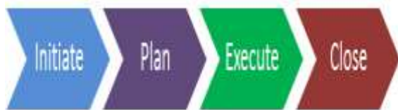
Fig. 1: project management lifecycle

Above are the stages of a project and they illustrate the most efficient path from beginning to end. Generally, the project gets started executing, but then realize that team is unaware of what they are executing. So the team has to come back and restart the lifecycle path and work out what they want to do. In this case, the team is unaware of or can't gauge the deadline. Similarly, the project cannot track details of the budget. Hence team has to work on planning. In this case cost of project shoots up because of rework and elapsed time. While visualizing this scenario, consider organization is trying to launch a new product to market before your competitor and unaware of when it will be ready to launch. Then marketing team cannot do their job. Similarly, if cost is unidentified or misidentified then no one can decide on a price. Hence organization or team has to consider the more mature cycle of project execution as below.