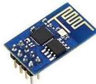
Fig. 3: Wi-Fi Module

The device developed in this project can be installed using any Wi-Fi hotspot in a populated urban area. As the device is powered, the Arduino board loads the required libraries and start sensing data from the MQ-135 sensor. The sensor can be calibrated so that its analog output voltage is proportional to the concentration of polluting gases in PPM. The Wi-Fi module is configured to connect with the ThingSpeak IOT platform. The Wi-Fi module can be connected with the ThingSpeak server by sending AT commands from the module.