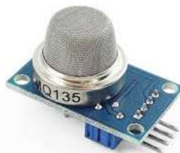
Fig. 4: MQ135 sensor

The MQ135 sensor is an air quality sensor for detecting a wide range of gases. Ideal for use in an office or a factory. The MQ135 gas sensor has high sensitivity to Ammonia, Sulfide and Benzene steam, also sensitive to smoke and other harmful gases. It used to detect the amount of air pollution present in the air and sends it to the Arduino Uno.