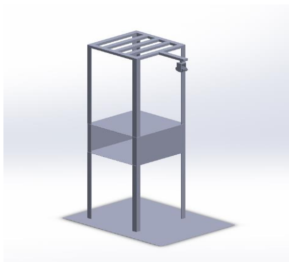
Fig. 1: Basic structure

A speed sensor is used in the project which will sense the speed of the falling cage send it to the controller to take a decision whether to apply brakes or not.